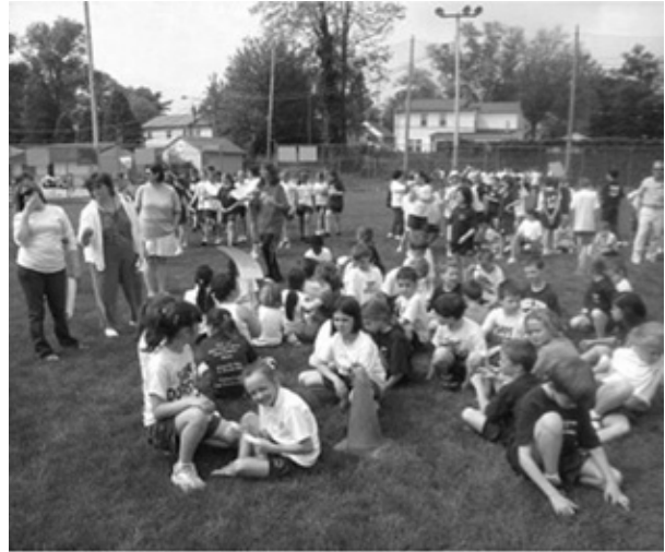
Getting Ready to Enjoy the Day