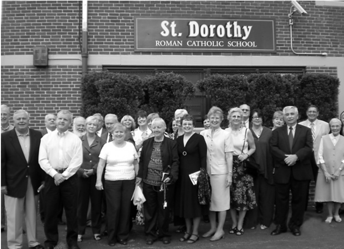
A BLAST FROM THE PAST ~ CLASS OF 1959